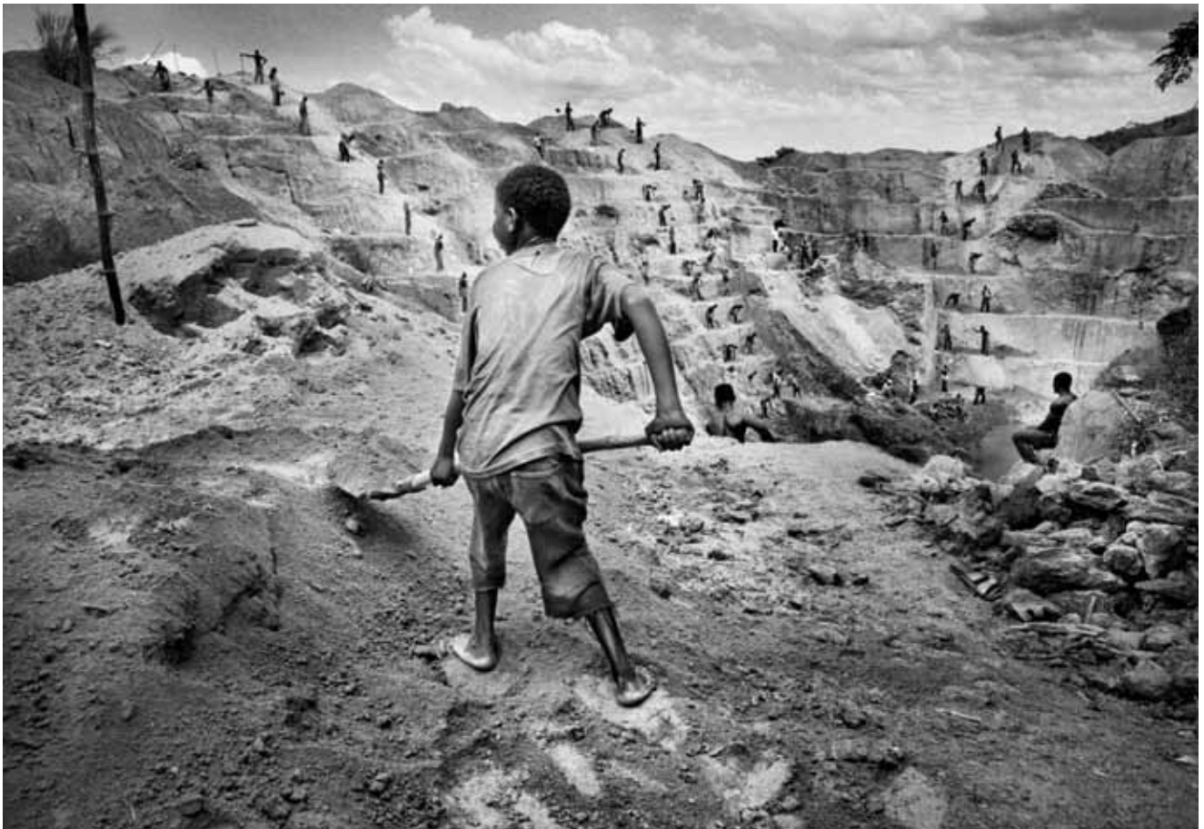
A child mines for gold in Watsa, Ituri province, Democratic Republic of Congo, October 2004.

Auditors like Ernst & Young play a major public interest role in providing assurance that companies are meeting important standards. If auditors cannot be relied upon to meet the highest ethical principles, then progress in breaking the links between natural resources and conflict could be undermined.