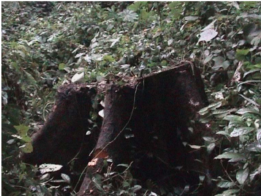
A Pycnanthus angolensis outside the AB boundary of ARB 027