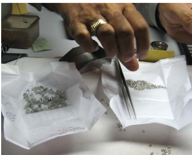
KP participants must strengthen oversight of the diamond industry to curb the illicit trade in rough diamonds.

KP statistics for West Africa reveal worrying trends. In 2005, 2006 and 2007, Sierra Leone reported identical production and export figures. This was also the case for Ghana in 2005 and 2006, and for Liberia in 2007. This trend suggests that authorities have no credible data for national production capacity. Guinea's statistics have exposed large discrepancies with trading partners for over four years running, but the government has not taken steps to reconcile these differences.