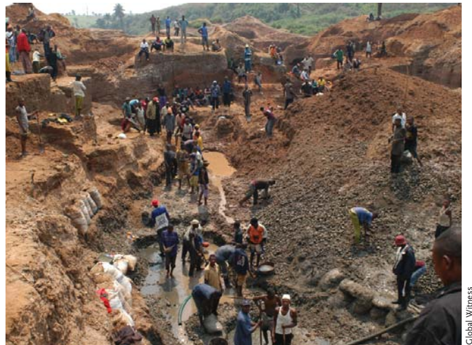
The artisanal mining sector is particularly difficult to regulate, and hundreds of thousands of informal diggers operate outside of government controls.