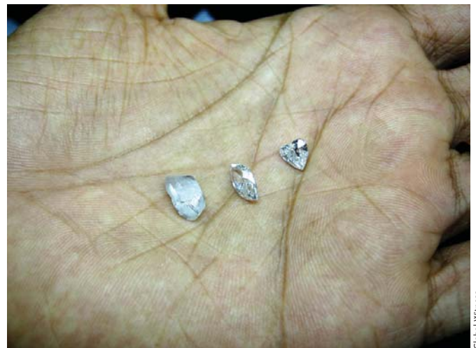
Strong controls are needed all along the diamond supply chain, and the cutting and polishing sector should adhere to KP minimum standards.

An estimated 200,000 carats of rough diamonds are being produced in Venezuela every year. None are being exported legally, and none are being recorded in KP statistics. It is safe to assume that few, if any, are staying in Venezuela. There is good evidence that many of the diamonds are being smuggled out through Brazil, and more significantly through Guyana. Guyanese officials deny the charge, and KP peer review visits of Brazil and Guyana skirted the issue. Neither review team went anywhere near the Venezuelan border where smuggling takes place openly.